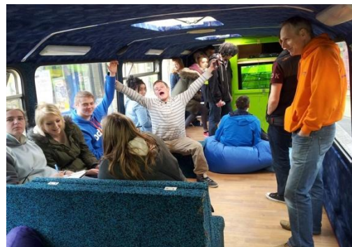
Young people enjoying themselves at the bus station

We are still going there on a regular basis as good relationships continue to be built. Questions are now being asked by some of the young people (“why are you doing this?”). This opens up conversations. Just remembering their names, we find, has a real positive impact on them and they always mind their Ps and Qs! We have also worked with Happy Days Homeless Charity in trying to find accommodation for one the young lads.