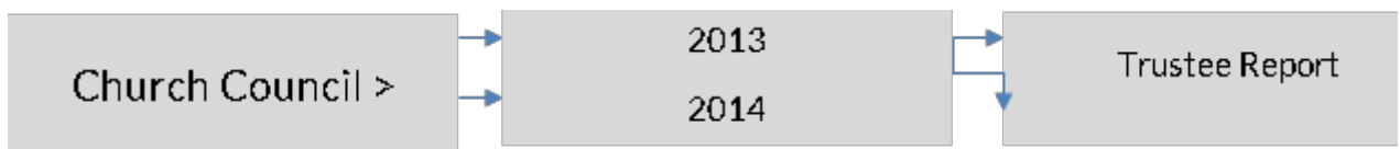
Fig. 2 – Selecting a trustee report year

Also, you can see a complete report of a previous return by going into the church return (for example), clicking Church Council and selecting the year (see Figure 2).