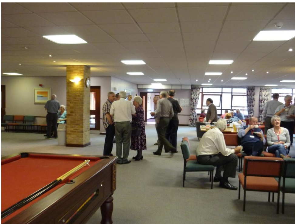
Networking at the Resourcing Mission Forum.