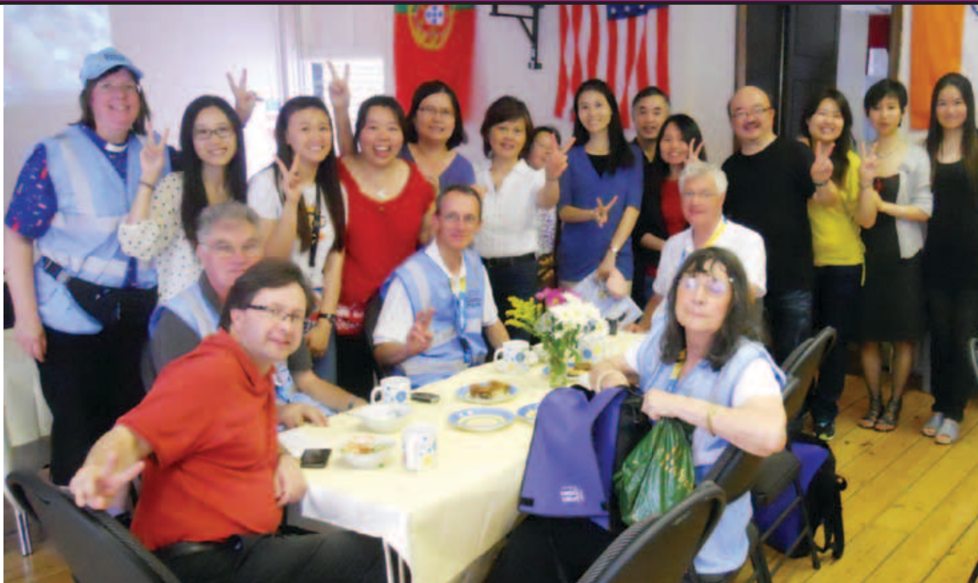
Kings Cross