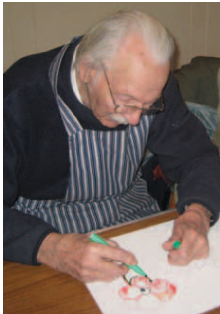
The painting class for people with dementia and their carers, photo from the Village Centre.

Englefield Green Methodist church, where the Village Centre is based, was not always a growth story. Back in 2002, the small congregation decided to cease worshipping in the Methodist church