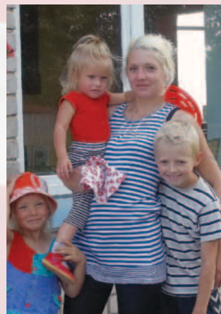
A family finishing their day at the after-school programme