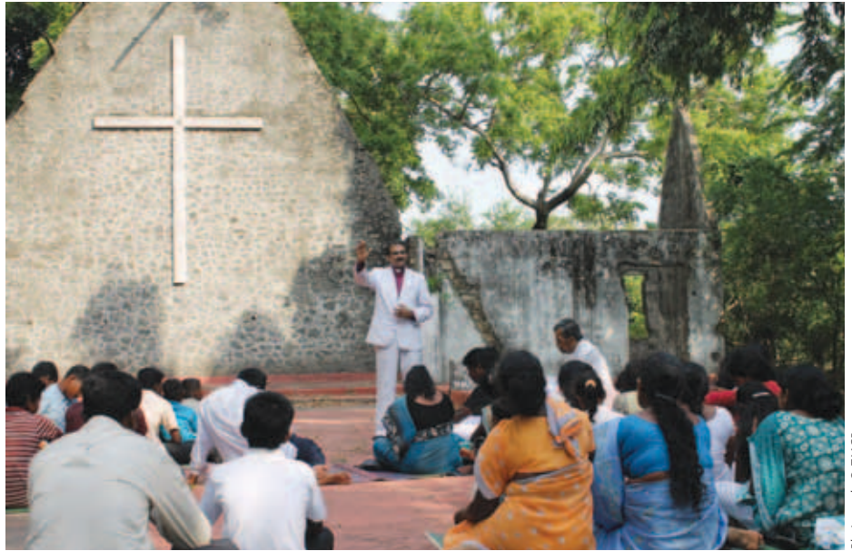
Service of dedication in the ruined church

In contrast, the Church is unique in its ability to work without seeking permission from the Presidential Task Force as it is classified as "existing local activity" and last year the Methodist Church in Britain was honoured to accept the invitation to partner with the Methodist Church of Sri Lanka.