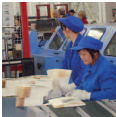
Many of the workers have been here since the work began 26 years ago

Official figures give the number of Christians as 23 million but it is likely to be far higher, maybe soon approaching 100 million. This is a huge number but a tiny proportion of China's population. Christianity is growing very quickly; so too are Buddhism, Islam, Judaism and Taoism. Providing adequate numbers of well-trained ministers is a priority