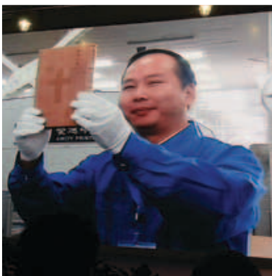
Amity's 100 millionth Bible was produced