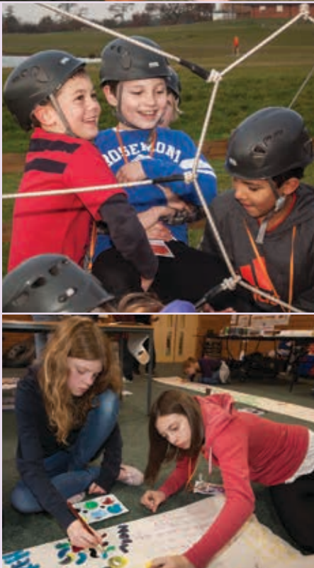
Above: Activities from 3Generate 2013 Below: BiG SleepOver resources