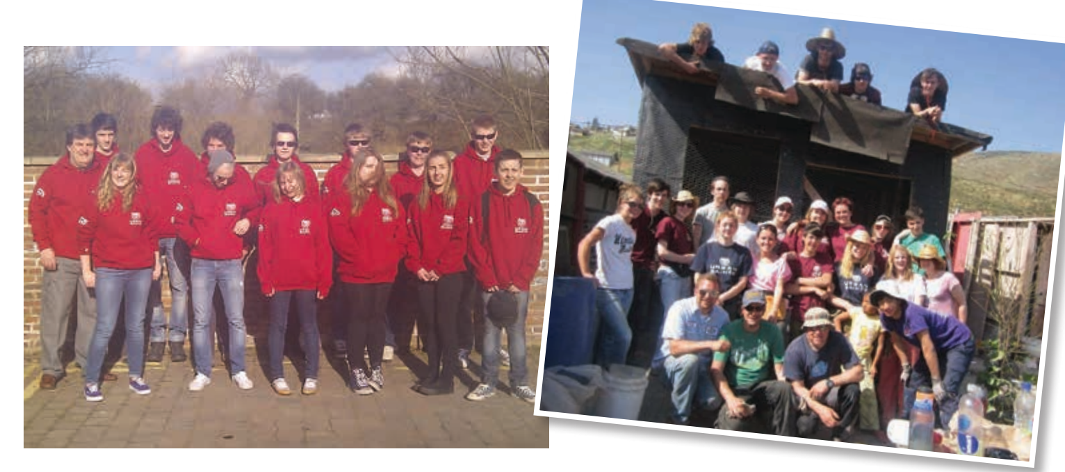
The team from Yarm prepare to leave for Mexico