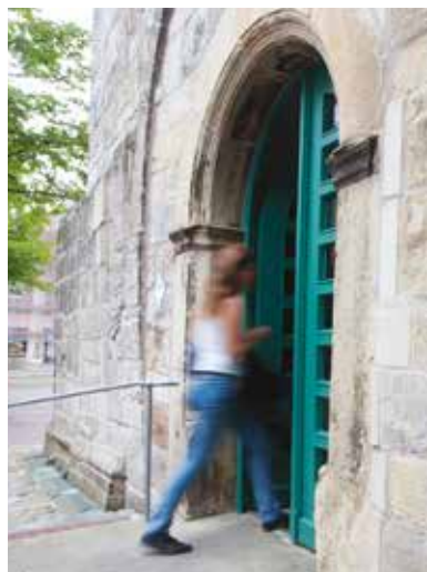
Left: Entering the 13th-century Liebfrauenkirche in Neustadt am Rübenberge for a prayer stop during the pilgrimage.