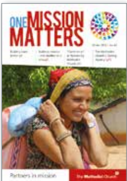
Cover image: A lady from Asrang VDC (Village Development Committee) in Gorkha, carrying a relief package home.