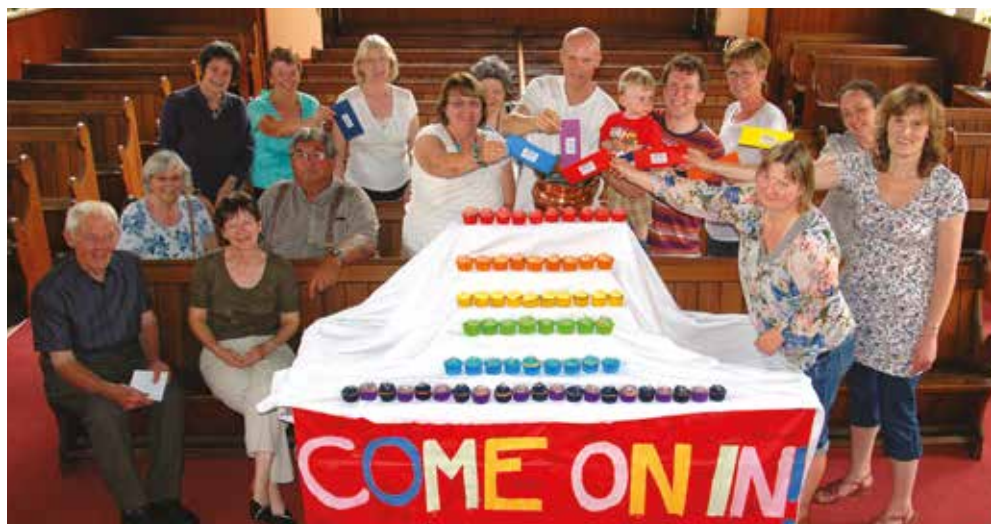
Right: Members giving their pledges of over £6,000 on our Gift Day in June 2014 to kick start our fundraising for the 'Come On In' project.

With your support, we can champion projects like 'Come on In' at Wicken Methodist Church. Donate to Mission in Britain via www.methodist.org.uk/give or by using the enclosed giving form.