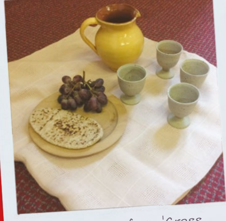
The last supper from 'Cross Factor' for year 5 pupils