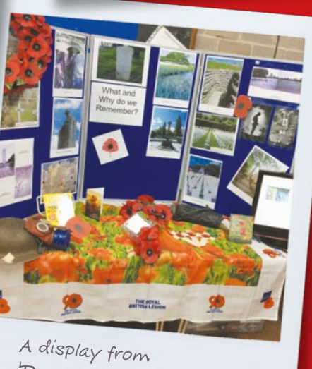
A display from Remembering WWZ'