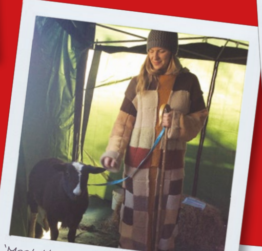
'Meet the Characters' - a shepherd at Broomhall and Sound Methodist Church