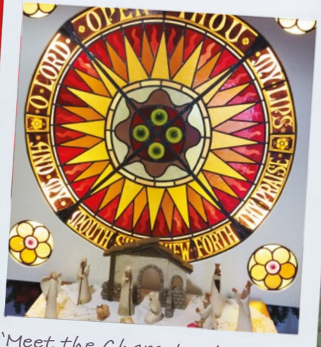
'Meet the Characters' at Penketh Methodist Church

The Revd Gill Stanning (CofE) leads a 'Cross Factor' workshop