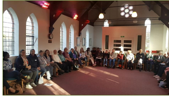
A group from Christ Church, Waltham Cross using the Church and Hall for a Quiet Day

The rural setting of the village provides many interesting walks including pathways along the River Beane