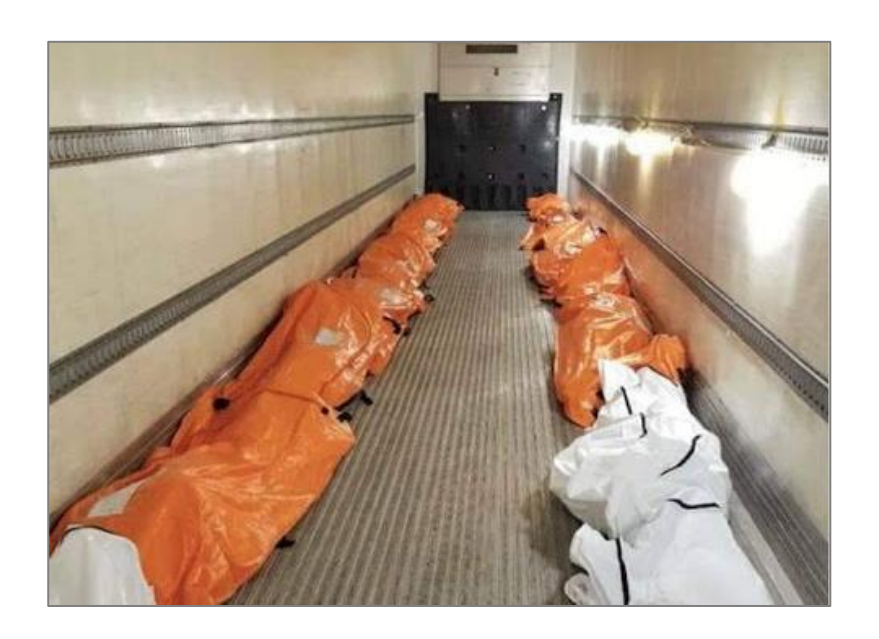
Lord have mercy Christ have mercy Lord have mercy

New York state records the highest numbers of deaths in the US due to corona virus. Officials warn that key medical supplies, including ventilators and PPE (personal protective equipment) are dangerously low. The dead in Brooklyn are stored in a refrigerated truck as space in the hospital morgue runs out.