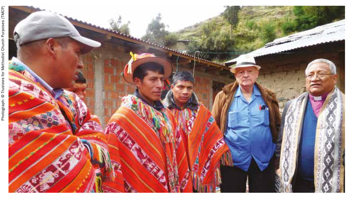
SALT grant recipients