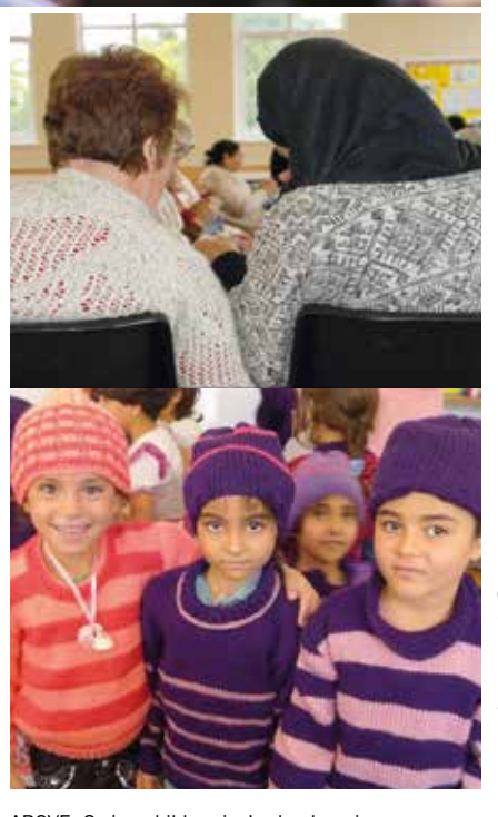
ABOVE: Syrian children in Jordan keeping warm wearing donated knitted clothes

Loving your neighbour: it's simply about eating and laughing, knitting and cooking together!