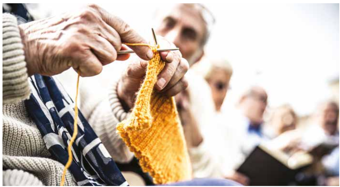
RIGHT: Two ladies knitting together