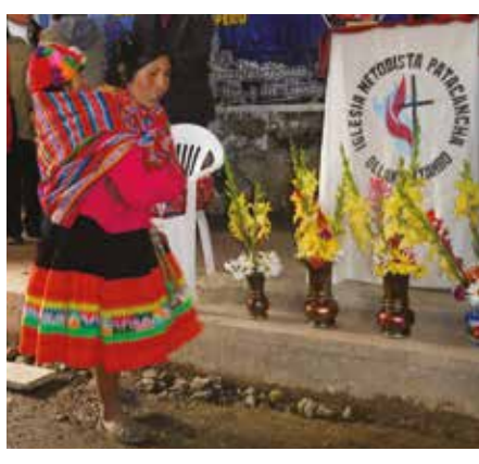
Quechua woman worshipping God with her offering in Patacancha