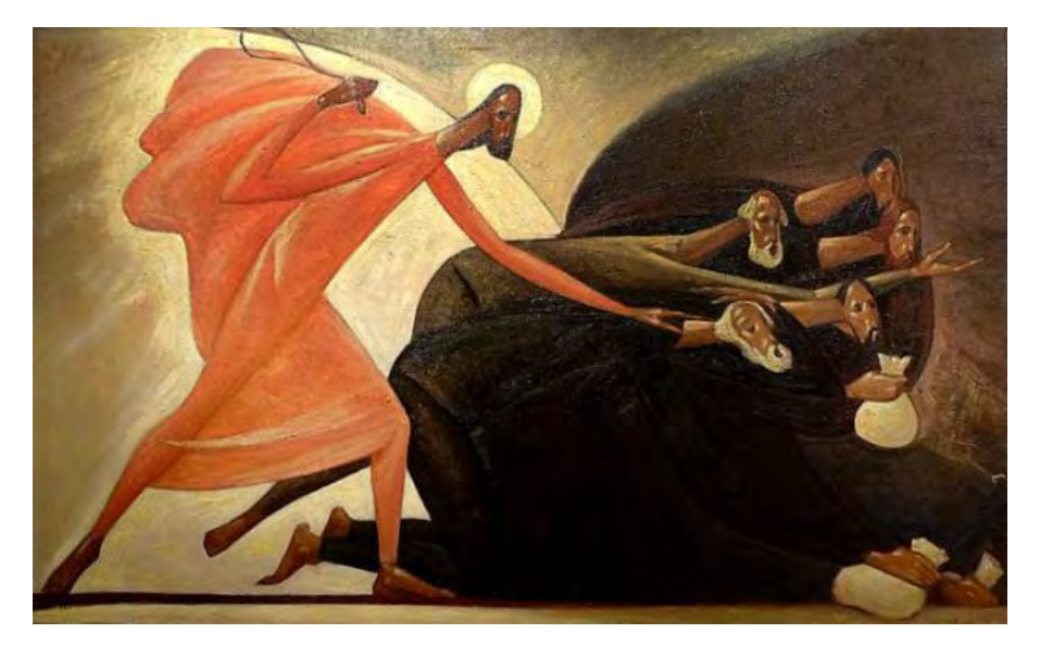
Every day he was teaching in the temple. The chief priests, the scribes, and the leaders of the people kept looking for a way to kill him. (Luke 19:47)

'My house shall be called a house of prayer'; but you are making it a den of robbers." (Matthew 21: 10-13)