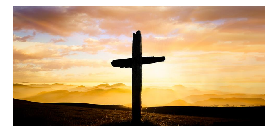
Then Jesus, crying out with a loud voice, said: 'Father, into your hands I commend my spirit' - Luke 23:46

Find a cross or make a simple one from material to hand and trace your fingers over it.